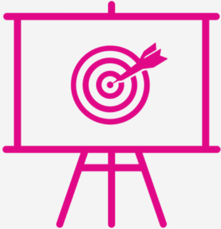
Business and Advice Strategy